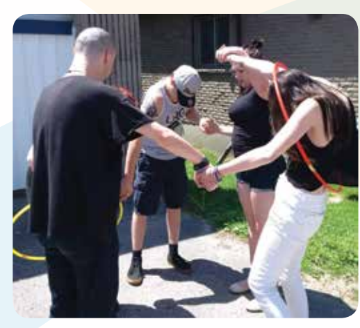
Participants doing a teambuilding exercise.